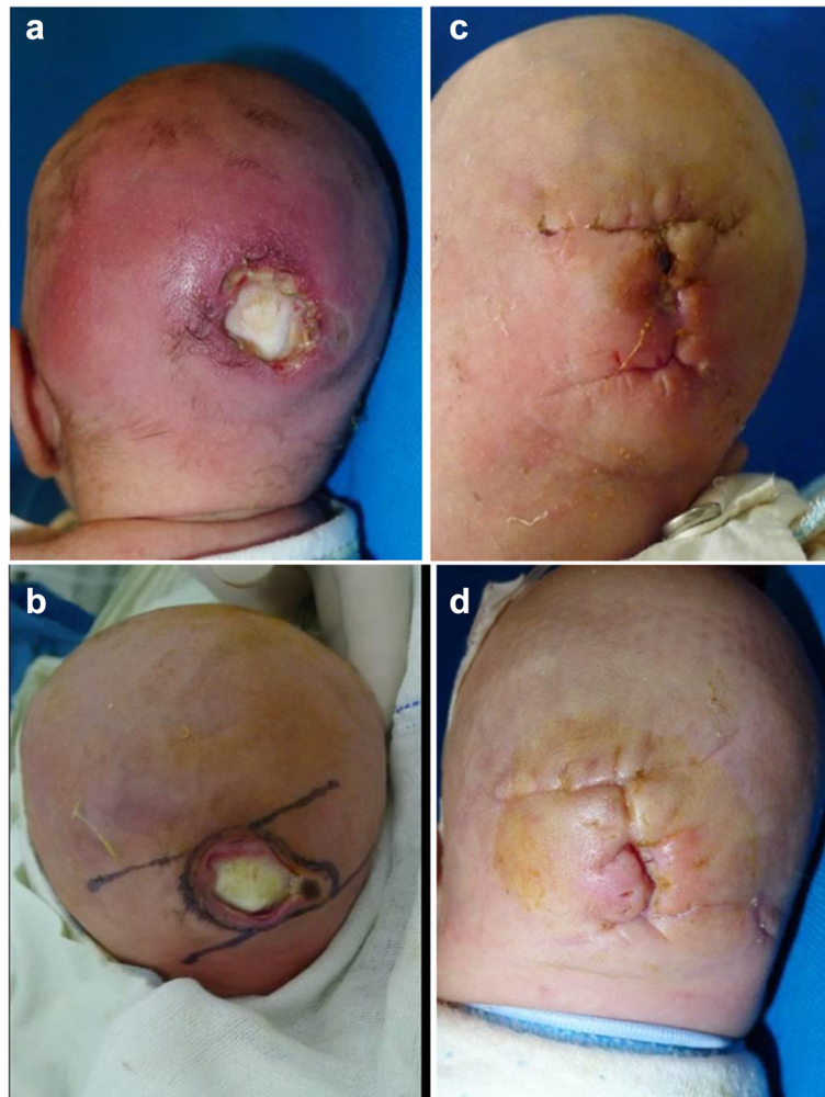
Fig. 2 Male neonate, nine days, pressure sore on the occiput a Pre-operation. b Repair wound with local flap. c Wound dehiscence on the central site. d Wound healing after the second operation