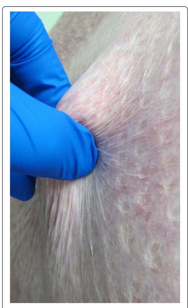
Fig. 5 Long term outcome of Meek grafting with good tissue pliability

Despite two thirds of our patients having had positive findings on wound microbiological assessments, our average Meek graft take rate remained at 87 %,