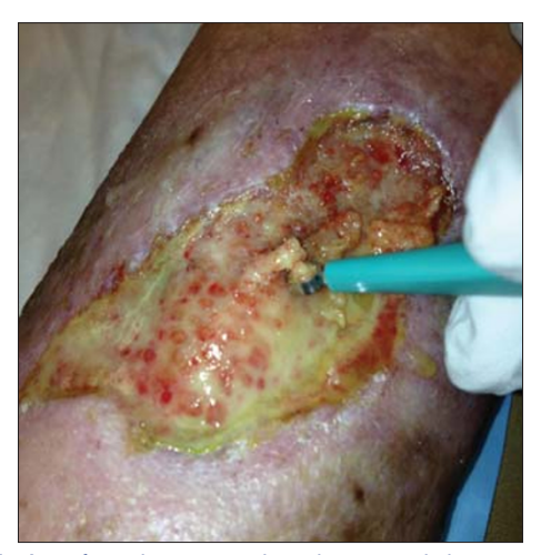
Figure 1: An infected traumatic leg ulcer in a diabetic patient with moderate peripheral arterial disease. Curettage was used to remove the pale yellow, slimy biofilm from the wound. Small buds of granulation tissue can be seen beneath the biofilm.