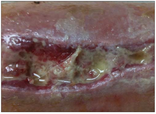
Figure 2: A dehisced surgical incision in a relatively ischemic patient. The opaque film on the wound bed (centre) re-formed daily and could be lifted off to reveal intact granular buds. Ultrasonic debridement was ineffective at disrupting or removing this thick, mature biofilm. Slough is also evident on the intact skin around the wound (top centre, top right, bottom right).

The Northwestern University group in Chicago has conducted a series of in vivo studies in recent years, expanding our understanding of the effect of biofilm on wound healing [Table 3]. Visible biofilm was observed to significantly delay closure of the epithelial gap in a murine