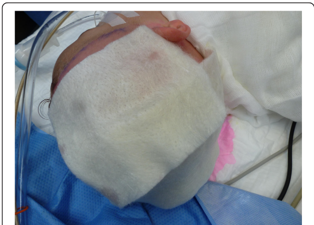
Fig. 7 Definitive alginate dressing. This dressing will adhere to the donor site and form a crust, allowing the donor site to heal underneath with minimal pain