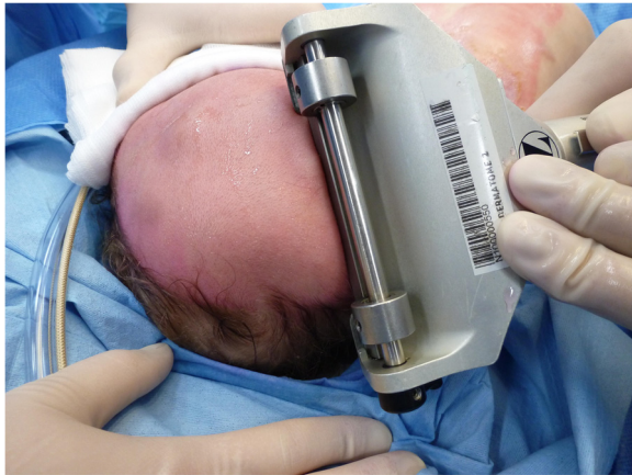
Fig. 3 Harvesting procedure. Harvesting of the split-thickness skin graft

bandage and gauzes are moist, only these are changed, leaving the alginate dressing in place. After this period, the alginate dressing forms a dry adherent crust and the upper bandages and absorbent gauze can be removed.