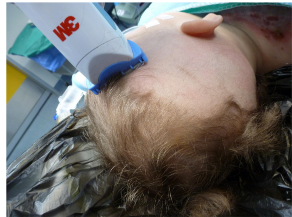
Fig. 1 Preparation of the donor site. Shaving of the scalp

The procedure of skin grafting from the scalp is performed by an experienced burn surgeon. First, the scalp is shaved, and if there is any risk of harvesting of the skin outside the boundary of the scalp, the hairline is indicated with a surgical marker (Fig. 1). Thereafter, the donor site is disinfected with a chlorhexidine solution (0.5 % chlorhexidine with 70 % alcohol) and infiltrated