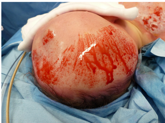
Fig. 4 Harvesting procedure—continued. Aspect of the donor site after superficial harvesting, with intact hair follicles

In literature, the thickness of the harvested skin graft is usually indicated by the setting of the dermatome, not by actual measurement of the graft. In practice, we have found that the thickness of the graft may vary with the same dermatome setting. We, therefore, insert a scalpel blade between dermatome blade and guard before harvesting, with the edge of the blade just fitting in between, to check the setting of the dermatome and to adjust if necessary (Fig. 8) [2]. In practice, we found that by adjusting the dermatome setting to the thickness of