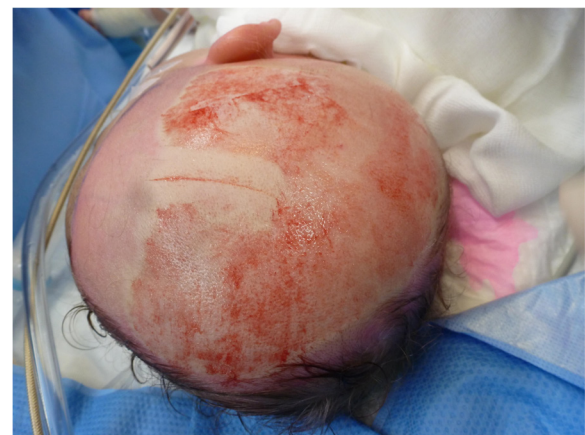
Fig. 6 Aspect of donor site after hemostatic dressing. Note the pale aspect of the surrounding intact skin due to the applied adrenalin solution

The definition of donor site healing is an epithelialisation of 95 % of the donor site. This is appraised by a medical professional, i.e. burn physician, on a routine outpatient check-up at around 2 weeks postoperatively, or in the clinic at detachment of the alginate crust.