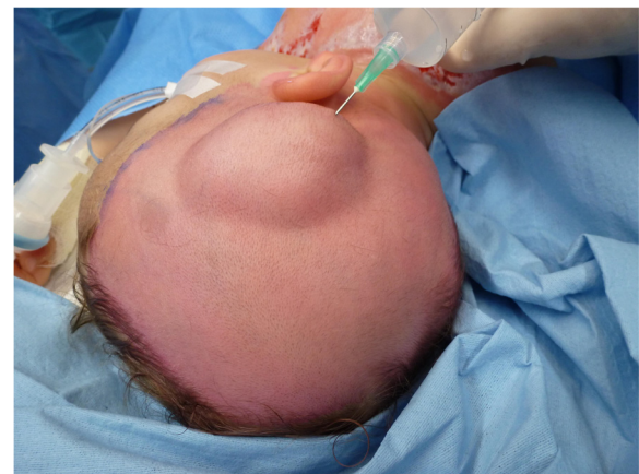
Fig. 2 Preparation of the donor site—continued. Subgaleal infiltration of the donor site, with indication of hairline visible

In the first 3 to 5 days postoperatively, the exudate from the donor site keeps the alginate moist, enabling the alginate dressing to migrate or dislodge. During this period, the outer bandages are necessary to protect the donor site and secure the alginate dressing. If the outer